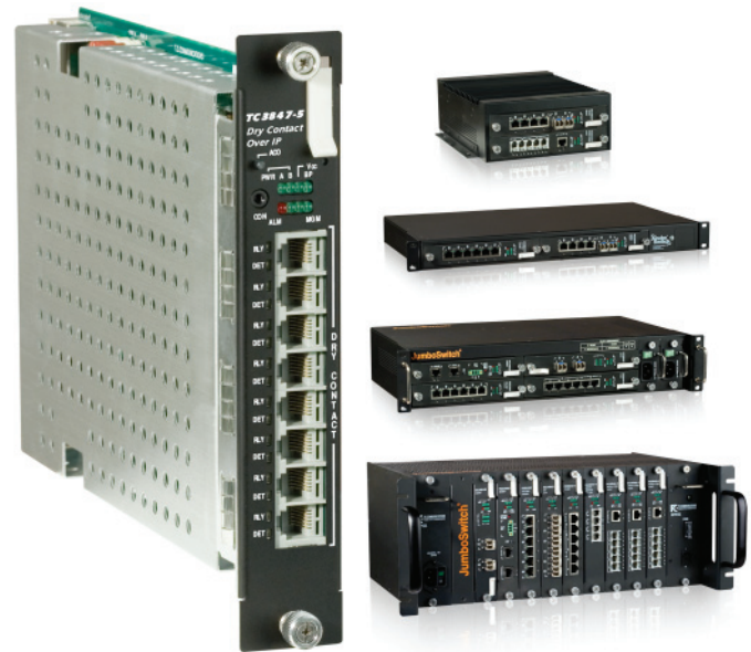
TC3847-5 8-Channel Dry Contact-over-IP Gateway

T he TC3847-5 is ideal for situations where a user needs to extend dry contacts across existing Layer 2/Layer 3 networks and low latency is important.