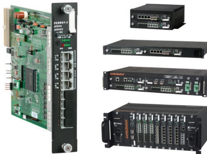
TC3847-1 4-Port RS-232 or RS-422/RS-485 Serial Server

C ompact and simple to configure, the TC3847-1 Serial Server transports four channels of RS-232 or RS-422/RS-485 data over existing Layer 2/Layer 3 networks. Each channel is independent, so it is possible to mix RS-232 and RS-422/RS-485.