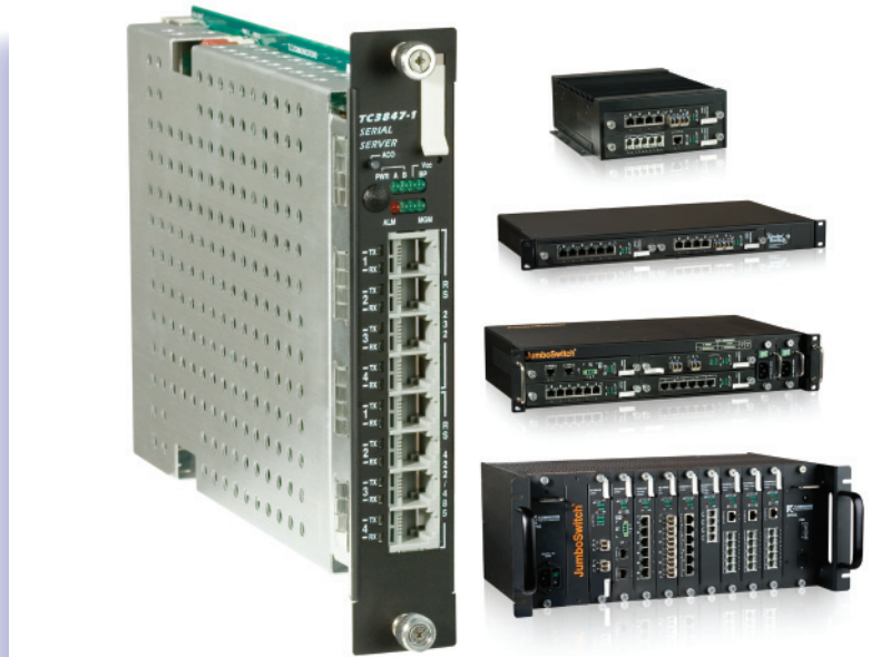
TC3847-1 4-Port RS-232 or RS-422/RS-485 Serial Server

C ompact and simple to configure, the TC3847-1 Serial Server transports four channels of RS-232 or RS-422/RS-485 data over existing Layer 2/Layer 3 networks. Each channel is independent, so it is possible to mix RS-232 and RS-422/RS-485.