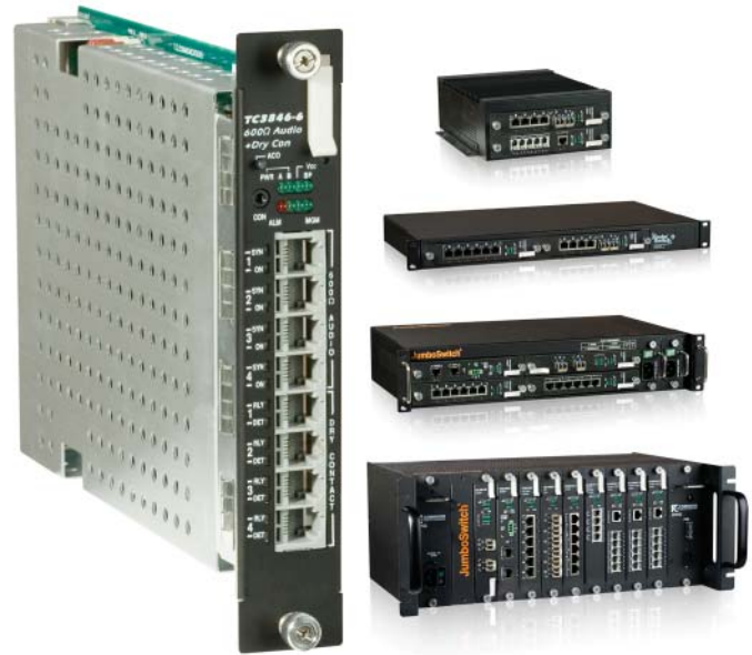
TC3846-6 4-Ch. 600Ω Analog & 4 Ch. Dry Contact IP Gateway

Featuring extremely low latency, the TC3846-6 Analog + Dry Contact IP Gateway links or extends 4 channels of 600Ω 2/4 wire analog and 4 channels of dry contacts across Layer 2/3 Ethernet networks. It is simple to configure and supports point-to-point and point-to-multipoint topologies.