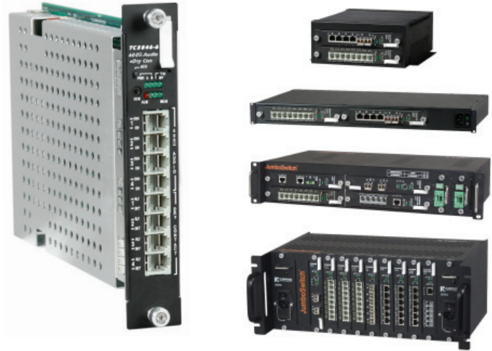
TC3846-6 4-Ch. 600Ω Analog & 4 Ch. Dry Contact IP Gateway

Featuring extremely low latency, the TC3846-6 Analog + Dry Contact IP Gateway links or extends 4 channels of 600Ω 2/4 wire analog and 4 channels of dry contacts across Layer 2/3 Ethernet networks. It is simple to configure and supports point-to-point and point-to-multipoint topologies.