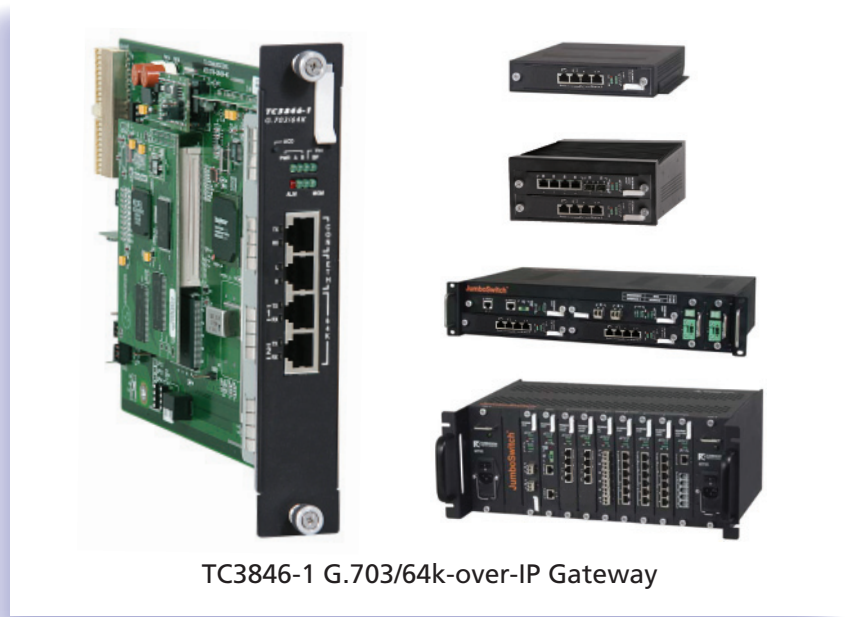
TC3846-1 G.703/64k-over-IP Gateway

Featuring extremely low latency of less than 5 msec., one way, the TC3846-1 G.703/64k-over-IP Gateway extends 64kbps G.703 co-directional circuits over Ethernet/IP networks. It is simple to configure and supports both point-to-point and point-to-multi point topologies.