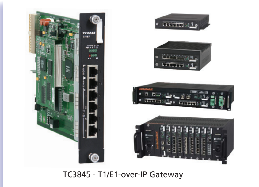
TC3845 - T1/E1-over-IP Gateway

Featuring extremely low latency, the TC3845 T1/E1-over-IP Gateway transports T1/E1 over Ethernet/IP networks. It is simple to configure and supports both point-to-point and point-to-multi point topologies.