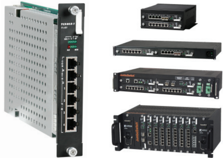
TC3845-1 with Various JumboSwitch Cages and Chassis

Featuring extremely low latency, the TC3845-1 T1/E1-over-IP Gateway transports T1/E1 over Ethernet/IP networks. It is simple to configure and supports both point-to-point and point-to-multi point topologies.