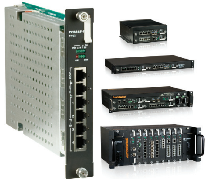
TC3845-1 with Various JumboSwitch Cages and Chassis

Featuring extremely low latency, the TC3845-1 T1/E1-over-IP Gateway transports T1/E1 over Ethernet/IP networks. It is simple to configure and supports both point-to-point and point-to-multi point topologies.