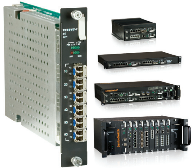
TC3842 with Various JumboSwitch Chassis & Cards Cages

F eaturing a wide range of advanced networking features, the TC3842 is a 6-Port SFP Gigabit Ethernet Switch. It is compatible with both SFP optical and copper modules and supports 850nm multi-mode and 1300/1550 single mode. Three versions are available: