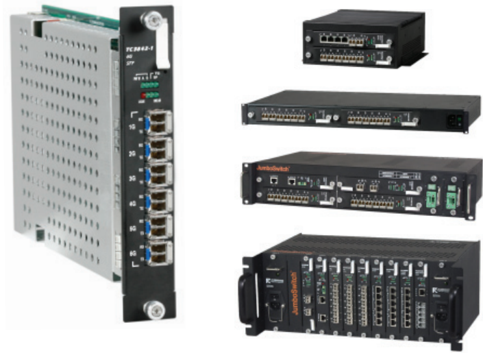
TC3842 with Various JumboSwitch Chassis & Cards Cages

Featuring a wide range of advanced networking features, the TC3842 is a 6-Port SFP Gigabit Ethernet Switch. It is compatible with both SFP optical and copper modules and supports 850nm multimode and 1300/1550 single mode. Three versions are available: