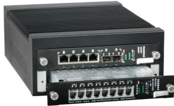
JumboSwitch 2S Standalone Chassis

T he JumboSwitch 2S standalone/wallmount chassis is designed to hold JumboSwitch family cards. The 2S chassis holds one Main/Management card and one interface card.