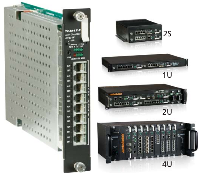
TC3847-5 8-Channel Dry Contact-over-IP Gateway

T he TC3847-5 is ideal for situations where a user needs to extend dry contacts across existing Layer 2/Layer 3 networks and low latency is important.